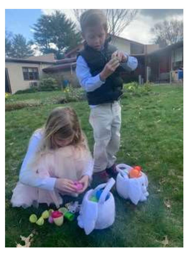
The kids had a blast hunting for eggs on Easter morning! And no one could resist climbing our favorite climbing tree—even in their Easter best!